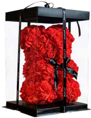
Rose teddy bear in a box (27cmx17cm)